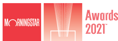
Castle Point 2021 Winner of the Morningstar Fund Manager of the Year: Domestic Equities, New Zealand