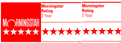
Morningstar Rating™ as at 30.06.22

Fees: 1.05% capped management fee which covers our management fee, the management fees of the underlying funds and normal operating expenses of the fund. No entry or exit fees are currently charged but there is a buy/sell spread on each investment/ withdrawal based on the transaction costs of the underlying investments. Please see www.castlepointfunds.com/5-oceans-fund for the current spreads.