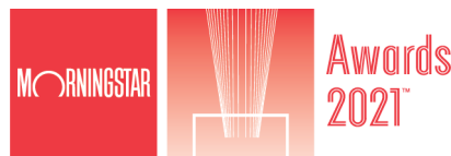
Castle Point 2021 Winner of the Morningstar Fund Manager of the Year: Domestic Equities, New Zealand