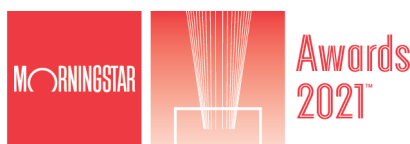
Castle Point 2021 Winner of the Morningstar Fund Manager of the Year: Domestic Equities, New Zealand