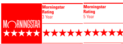
Morningstar Rating™ as at 30.11.22

Fees: 1.05% capped management fee which covers our management fee, the management fees of the underlying funds and normal operating expenses of the fund. No entry or exit fees are currently charged but there is a buy/sell spread on each investment/ withdrawal based on the transaction costs of the underlying investments. Please see www.castlepointfunds.com/5-oceans-fund for the current spreads.