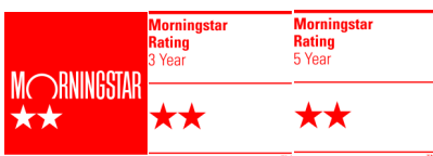
Morningstar Rating™ as at 30.11.21

Fees: 1.05% capped management fee which covers our management fee, the management fees of the underlying funds and normal operating expenses of the fund. No entry or exit fees are currently charged but there is a buy/sell spread on each investment/ withdrawal based on the transaction costs of the underlying investments. Please see www.castlepointfunds.com/5-oceans-fund for the current spreads.