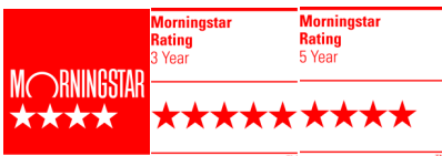
Morningstar Rating™ as at 31.07.22

Fees: 1.05% capped management fee which covers our management fee, the management fees of the underlying funds and normal operating expenses of the fund. No entry or exit fees are currently charged but there is a buy/sell spread on each investment/ withdrawal based on the transaction costs of the underlying investments. Please see www.castlepointfunds.com/5-oceans-fund for the current spreads.