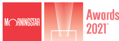
Castle Point 2021 Winner of the Morningstar Fund Manager of the Year: Domestic Equities, New Zealand